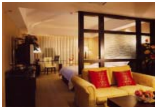
4-star ranking room