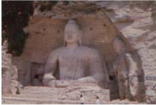
The Yungang Grottoes