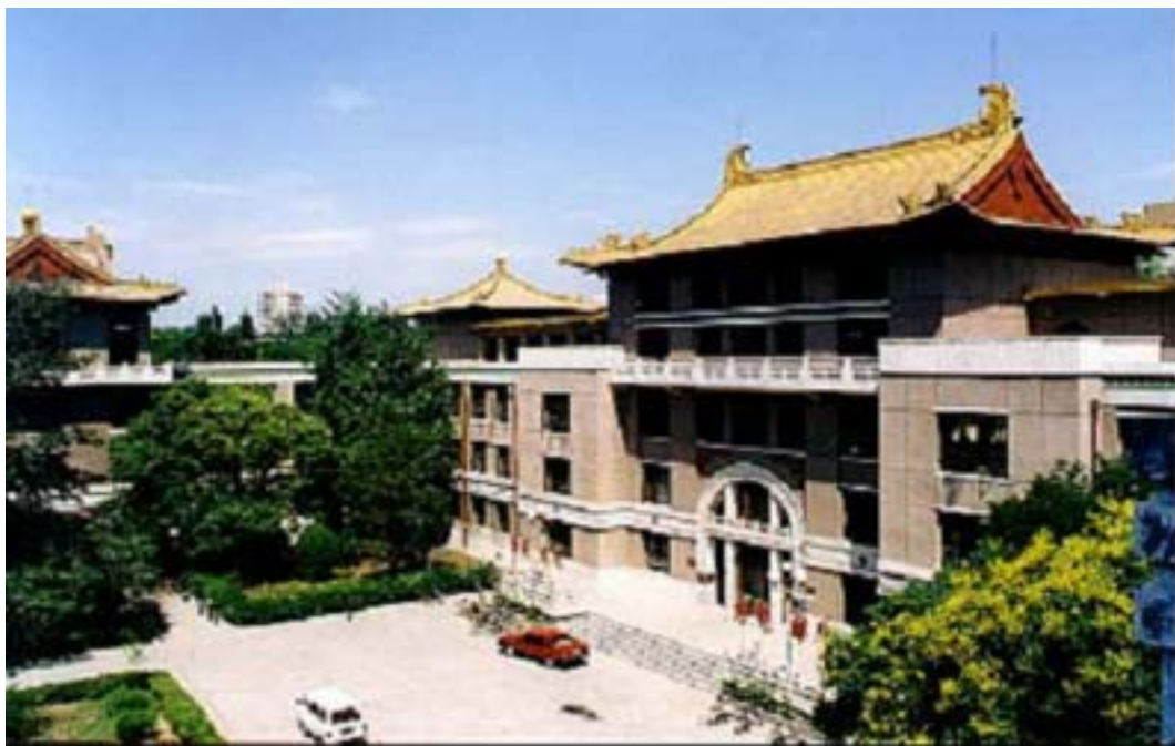
Key Laboratory of Coal Resources, CUMTB, Ministry of Education