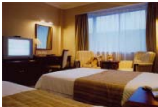
3-star ranking standard room