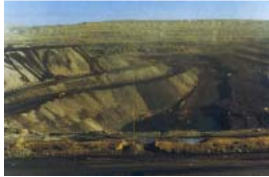
Antaibao Coal Mine at Pingshuo is China's largest high quality thermal coal surface mine.