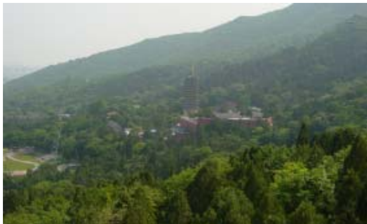
A glance picture of Western Hills, Beijing